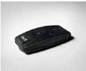
Remote control Smart 08999166